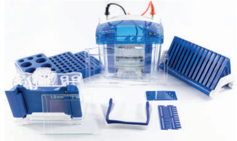
Components of the FastGene® PAGE Protein System gel electrophoresis set (PG01)