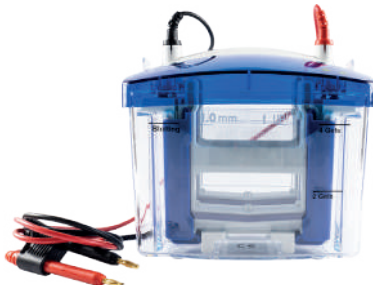
The FastGene® PAGE Protein System - Electrophoresis tank and lid